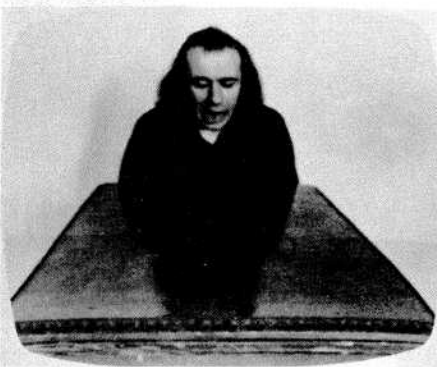
Vito Acconci , New York Born 1940, New York Sonnabend Gallery, New York Face Off (15 min. B&W), Overtone (15 min. B&W)